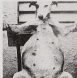
This dog will be killed to prove by autopsy that the alcohol she is forced has damaged her liver.