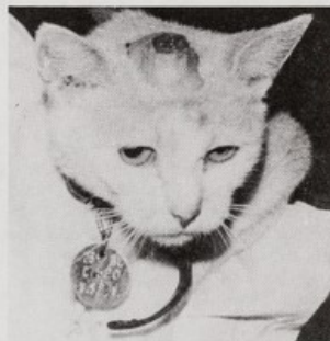
Cat with electrode implanted in its brain.