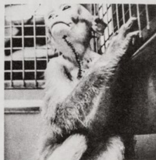
Ape prepared for head transplant.