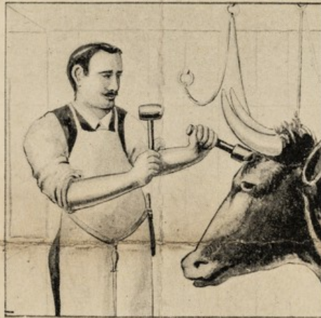
POSITION OF OPERATOR, SHOWING MACHINE IN USE. (A Longer Barrel provided for Wild Animals.)

The invention, which is a noiseless explosive apparatus, consists of a short rifled barrel, chambered to receive a small cartridge with steel-pointed bullet. It is terminated by a bell-shaped chamber, which serves to deaden the sound, protect the operator from the flash of the explosion, and direct the bullet through the brain into the spinal