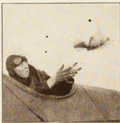
AVIATOR LIBERATING A PIGEON WITH A MESSAGE REPORTING ENEMY ACTIVITIES. THIS IS ONE OF FOUR HUNDRED SLIDES ILLUSTRATING THE COURSE OF LECTURES ON "OUR ANIMAL ALLIES IN THE WORLD WAR."