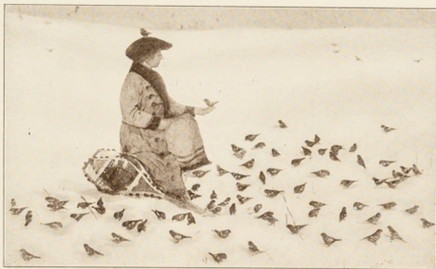
A RESIDENT OF MERIDEN, NEW HAMPSHIRE, FOLLOWING ADVICE GIVEN IN THE LECTURE "WILD BIRDS AND HOW TO ATTRACT THEM." THE BIRDS ARE WHITE-WINGED CROSSBILLS.