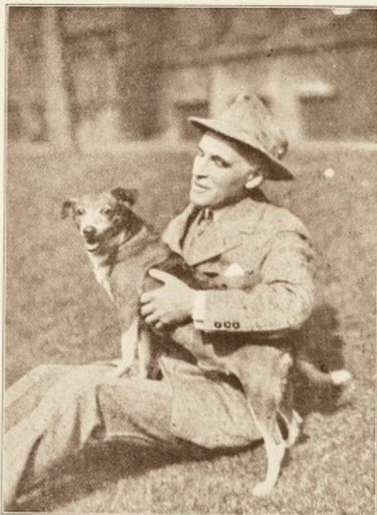
"BUSTER," A REAL "PAVLOV" DOG, THE WELL KEPT AND HAPPY LITTLE PAL OF THE DOCTORS AT CHICAGO UNIVERSITY. BUSTER HAS BEEN ASSISTING THE PHYSICIANS IN THEIR STUDY OF GASTRIC JUICE FOR NINE YEARS AND IS KNOWN AS "A MEMBER OF THE STAFF." FROM A SLIDE ILLUSTRATING "THE TRUTH ABOUT VIVISECTION."

The bitterness which is fostered by the vivisection controversy is largely the result of ignorance and misinformation, and one of the several objects of this lecture is to drive out the bitterness by letting in the truth.