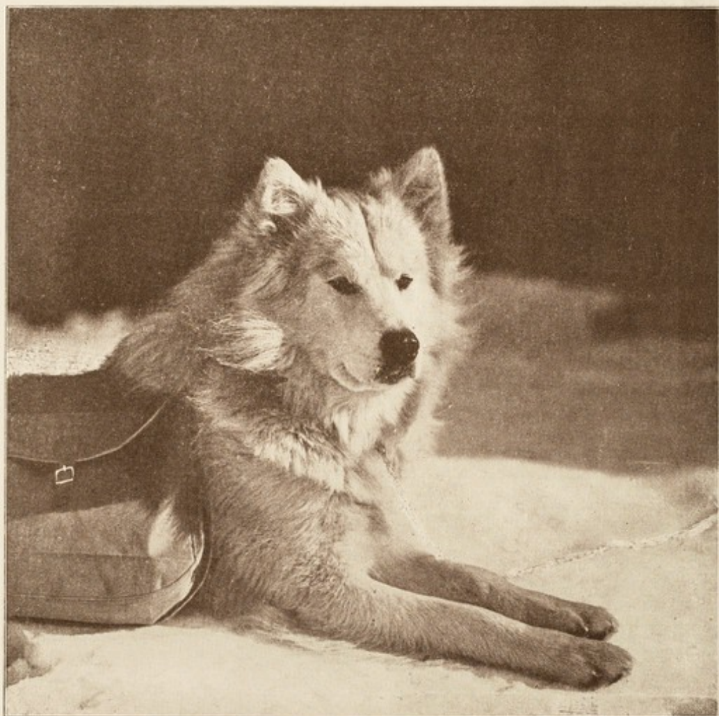
"POLARIS," THE FAMOUS DESCENDANT OF DOGS THAT HAULED PEARY'S FIRST SLEDGE TO THE POLE, AND THE HERO OF MR. BAYNES' FORTHCOMING BOOK "POLARIS THE GLORIOUS." FROM A SLIDE ILLUSTRATING "THE DOG—MAN'S NOBLEST FRIEND."

FOR FURTHER INFORMATION CONCERNING THESE LECTURES, AND FOR TERMS, DATES, ETC. PLEASE ADDRESS