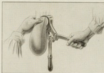
Fig. 3. - Second position: With the left hand push and close on the cord of the right testicle against the lateral walls of the bag. With the right hand place the jaws of the Pincers upon the cord.