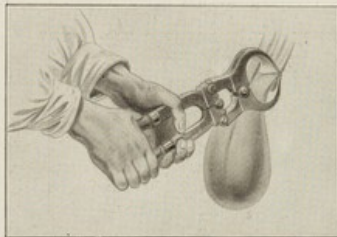
Fig. 5. - Fourth position: Apply both hands on handles of Pincers exactly as shewn in picture, and press firmly until the instrument is completely closed.