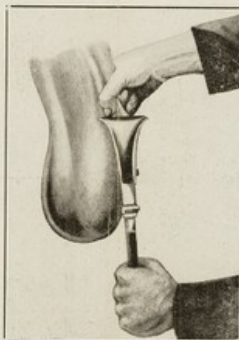
Fig. 6. - Fifth position: Press on to the cord immediately above the jaws of the Pincers with thumb and second finger until these almost meet, so indicating that the cord is completely severed. Repeat the operation on the cord of the left testicle and the bull is castrated.