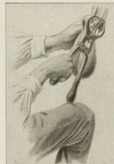
Fig. 4. - Third position: By the help of the right knee close the Pincers until the cord is compressed enough to be held in place.

These Trade Marks protect Farmers against spurious unreliable imitations: