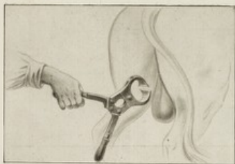
Fig. 2. - First position of the operation - The bull calf is castrated standing - The operation takes place behind the animal - Hold the Pincers opened with the right hand.