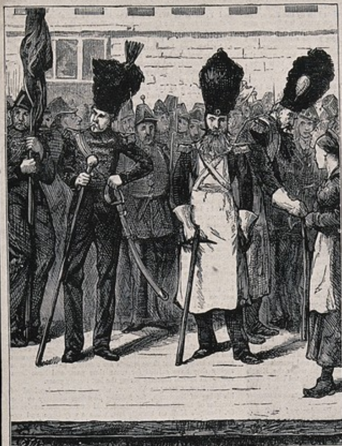
THE FALSE BEARDED SAPEURS POMPIERS AT FOURNEAUX