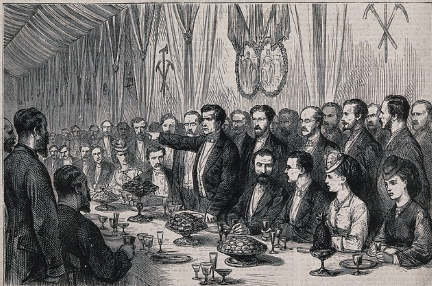
THE GRAND BANQUET IN THE PAVILION AT BARDONECCHIA