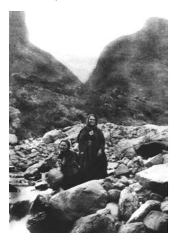
Figure 2: Photograph taken by Stephen Graham in the Terek Gorge of two Ingush women collecting water, published in Stephen Graham, A Vagabond in the Caucasus (London, John Lane, 1911), p. 140.

readers with descriptions of town and countryside, but rather to provide them with a rich mixture of anecdotes and observations, as well as offering a kind of confessional narrative about how he had been shaped by his experiences on the road. This style was to become a hallmark of the many travel books he wrote over the next few years. The accounts Graham wrote of his various journeys, including his first trip to the Caucasus in 1909-10, were typically highly impressionistic narratives - a jumble of reportage and introspection - which together formed a kind of picaresque autobiography containing his reflections on all he had thought and witnessed.