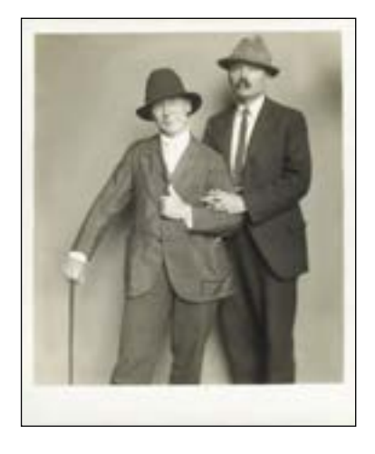
Figure 7: Press photograph of Vachel Lindsay and Stephen Graham (on the right) in 1921.

embedded in a background of leaves. The bird described in the poem 'The Pheasant Speaks of his Birthdays' is shown sitting by a branch set against the background of a mountain illuminated by the rays of the sun. Both poems and illustrations were inspired by their author's desire to import fantasy into the everyday world, to shake up settled ideas of landscape, and hint at ideas that Lindsay found difficult to articulate in discursive language. Reviewers did not altogether know what to make of the book. The critic in the New York Times described Lindsay as "the modern Mark Twain" whose best friends were the Mad Hatter and the March Hare. The review ended with a shrewd observation that the poet wanted to show how "beauty, humour and truth are one".60 The critic for Time assured his readers that Lindsay was not "crazy", although they acknowledged there was a kind of madness in "the very excited intensity of his sanity".61 Even the most generous critics nevertheless failed to get to the heart of the poet's elusive and allusive "message".