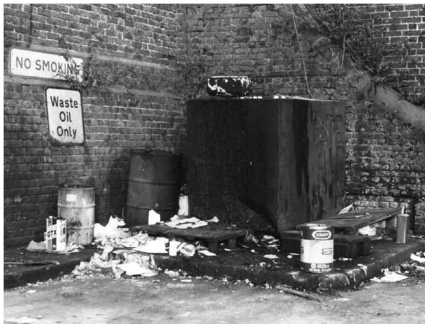
Figure 17: Waste oil container, civic amenity site in Hove, Brighton, c.1980

Coggins: A couple of comments on the civic amenity sites: the 1967 Civic Amenities Act, as Jeff said, sponsored by Duncan-Sandys, the conference that launched part three of that Act, dealing with civic amenity sites, had 850 delegates. I don't know if anybody has seen the report of that? 75 I've got copies electronically and on paper and, somebody asked me once, 'how much work have you done on civic amenity sites?' I counted up, and between 1984 and 1997, we conducted over 30,000 site interviews in the UK. All of that data is there in the background, and, yes, the Nottingham case I mentioned earlier. We also monitored the sites and, obviously, with wheeled bins more people stopped going to civic amenity sites. Whereas 30 years ago, probably there might have been an oil bank, there might have been a metal recycling, there might have been some glass banks, but the majority of waste going into civic amenity sites 30 years ago was waste; 80 per cent plus.