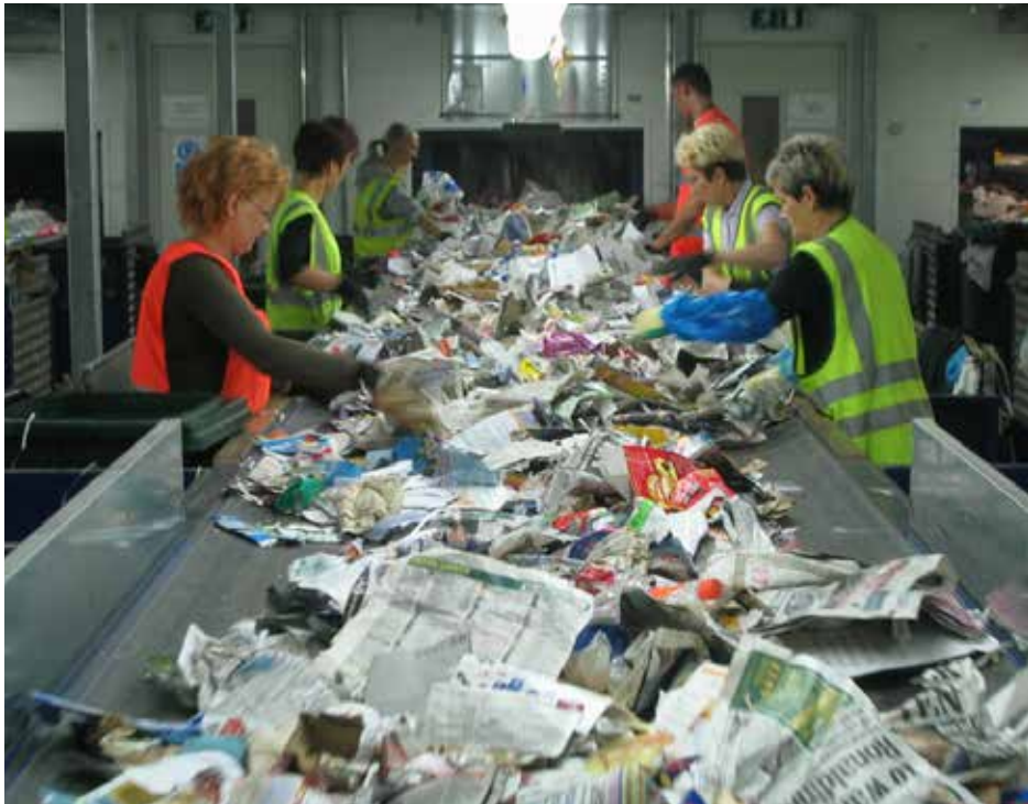
Figures 19 and 20: Milton Keynes' materials recovery facility, 2006