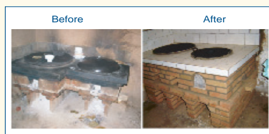
Figure 2: Biomass range stove intervention in Gansu Province

In Gansu , coal/biomass two-fuel range stoves are used (see picture). A growing number of locals are using coal because of the shortage in wood/crop residues due to forest protection policies. Typically the kitchens are separate, but without a door. The intervention includes improved chimneys and smoke tracts for heated beds.